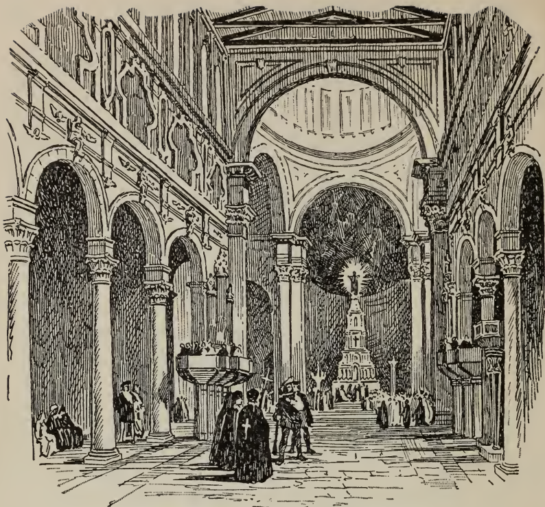
INTERIOR OF CATHEDRAL, MESSINA